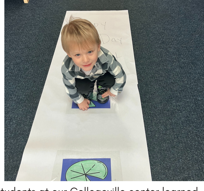
Students at our Collegeville center learned all about Leap Day!