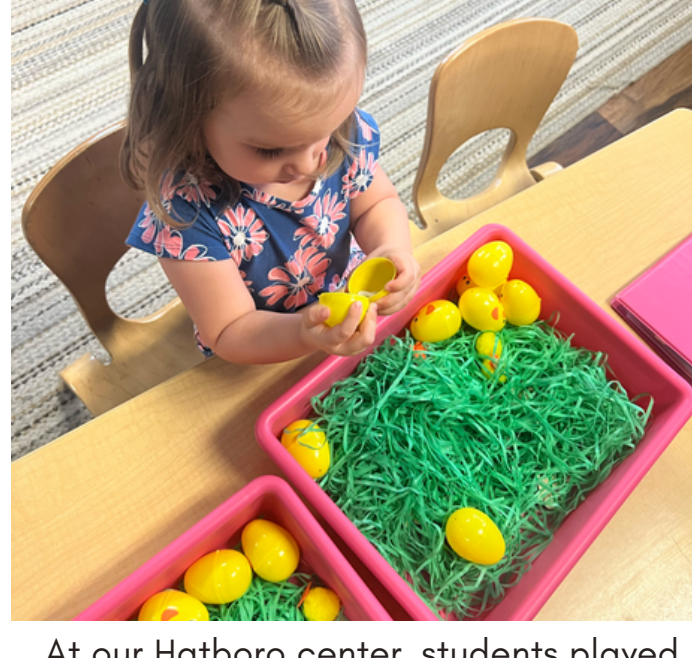
At our Hatboro center, students played a spring math game where they hunted for eggs and discovered numbers!