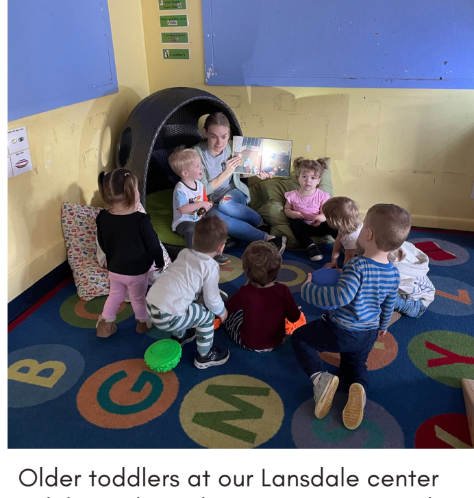
Older toddlers at our Lansdale center celebrated Read Across America with a flashlight reading activity!